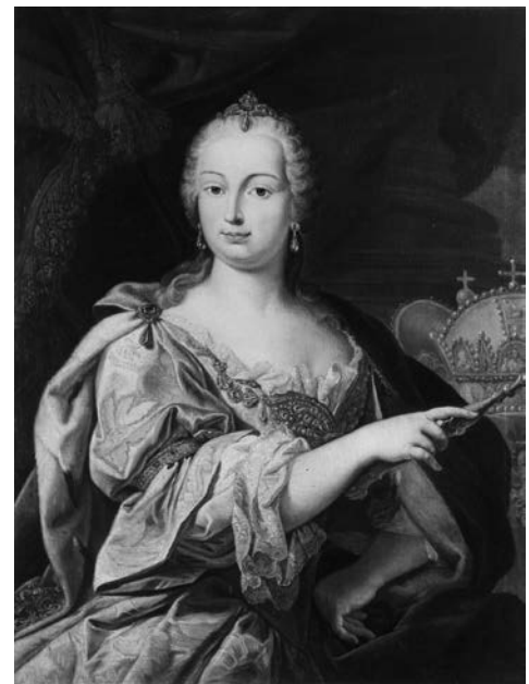
Maria Theresia of Austria