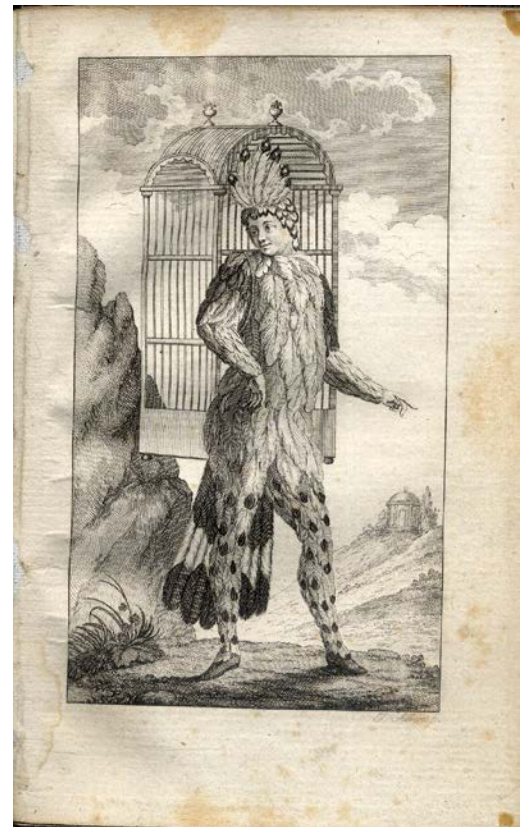
An engraving of Schikaneder as Papageno

— 1791 Mozart falls ill on November 22 and dies on December 5, likely from rheumatic fever.